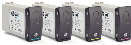
8 HP PageWide XL ink cartridges (2 x 400-ml per color with auto-switch)